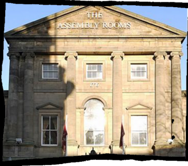
The Assembly Rooms: