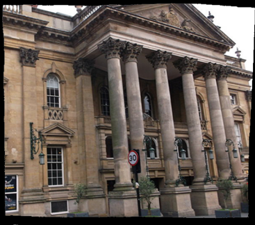
The Theatre Royal: