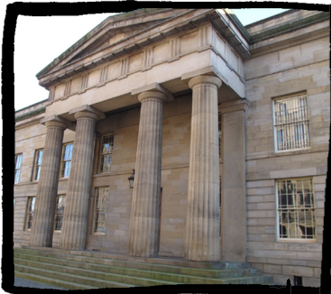
The Moot Hall:

Identify the column types on these three buildings in Newcastle city centre: